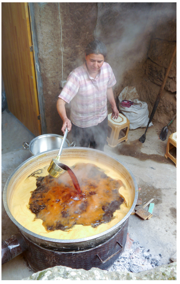
Figure 6. Today villagers producing their pekmez in large copper kettles