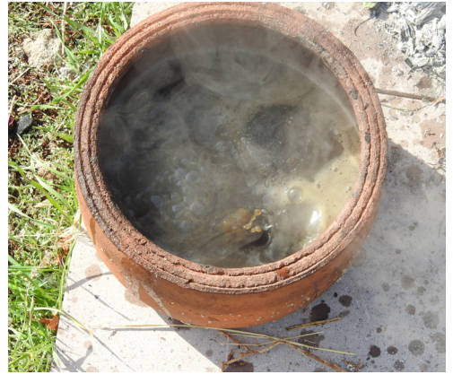
Figure 5. After cooling down for about two hours and getting clear, the pekmez is ready for use