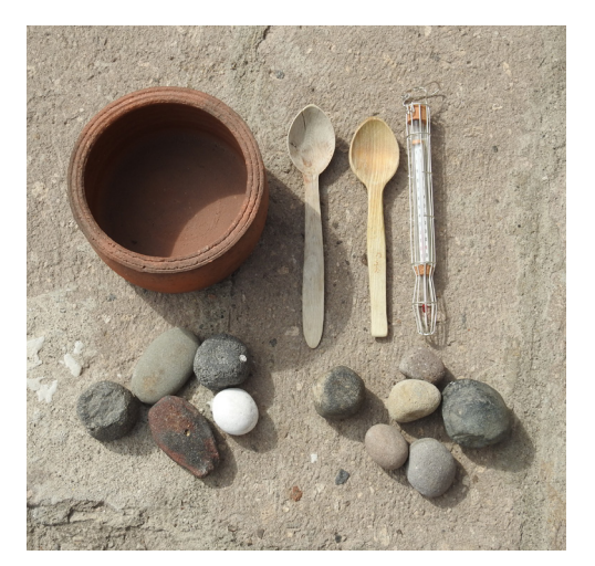
Figure 3. Pekmez production: Utilities for pekmez making