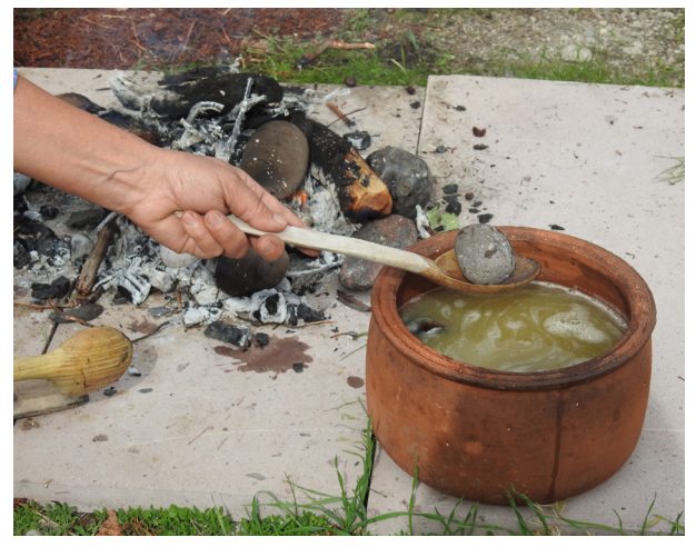
Figure 4. Heated stones to boil the water, a method known since prehistoric times