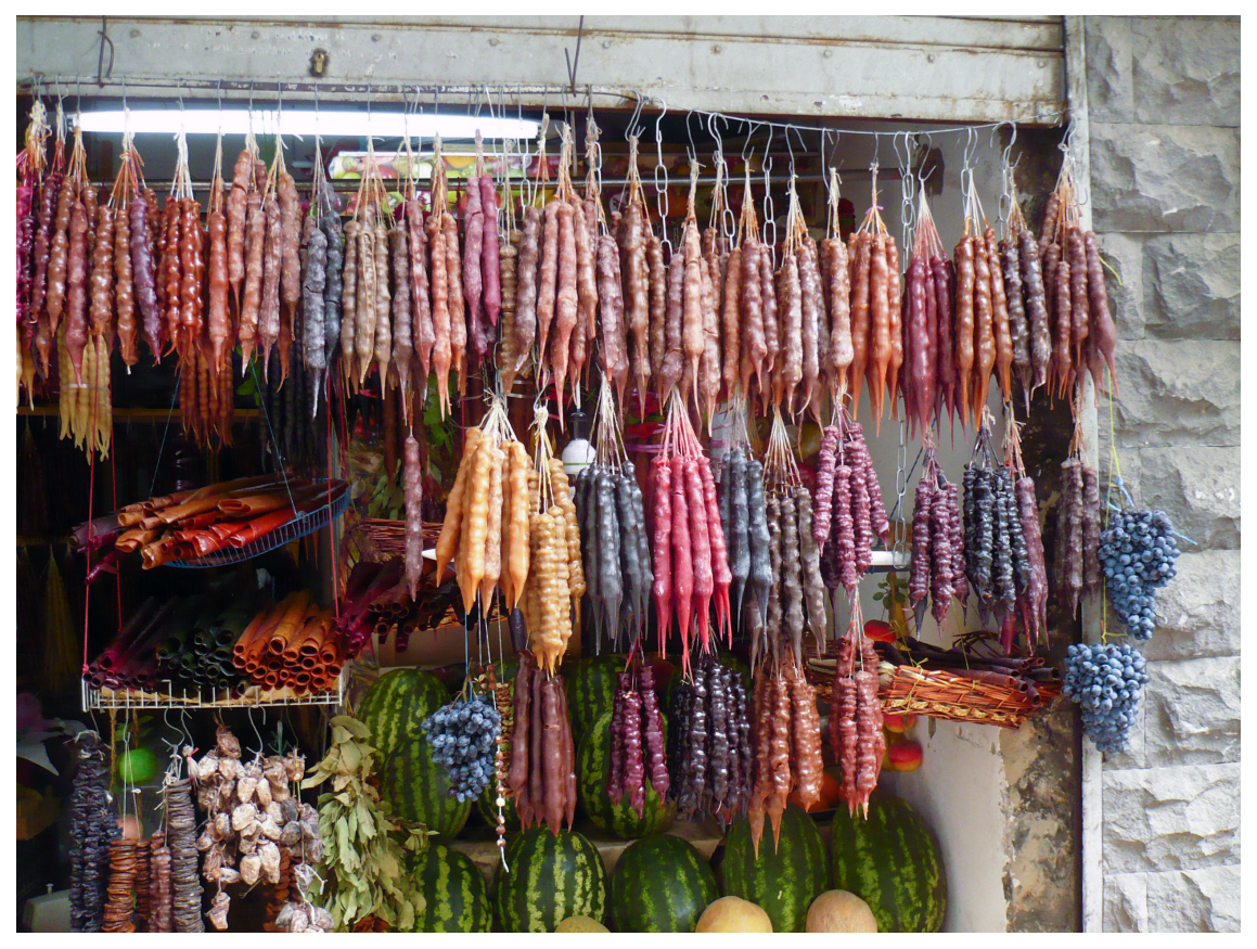
Figure 7. Pekmez products on sale